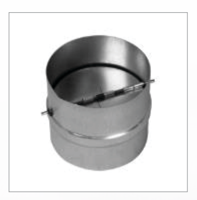
DRAFT BLOCKER 100mm