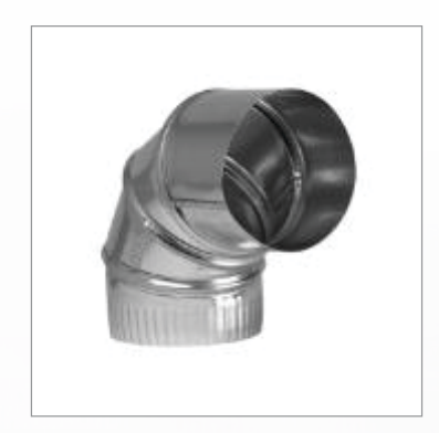
ADJUSTABLE ELBOW 0-90 DEGREES - 100mm