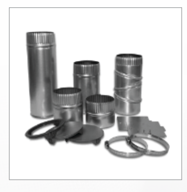
INTERNAL SIDE FLU KIT - TO CHANGE DRYER VENTING