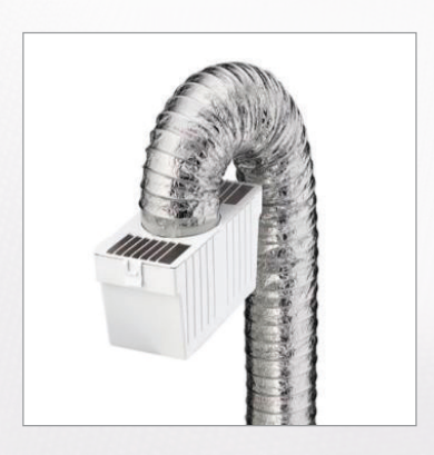
INDOOR LINT FILTER TRAP*