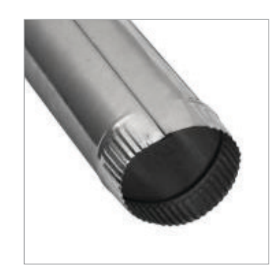
RIGID GALV DUCTING 100mm x 1200mm