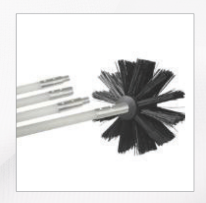
DRYER VENT CLEANING BRUSH