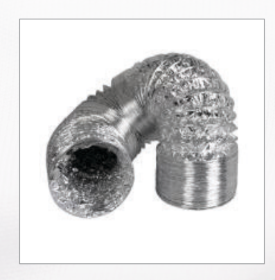
FLEXIBLE DUCTING* 100mm x 2.4m