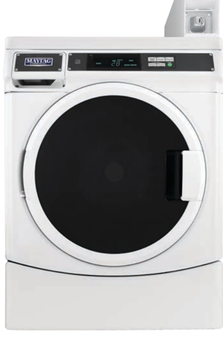
COIN DROP OR CARD READER READY