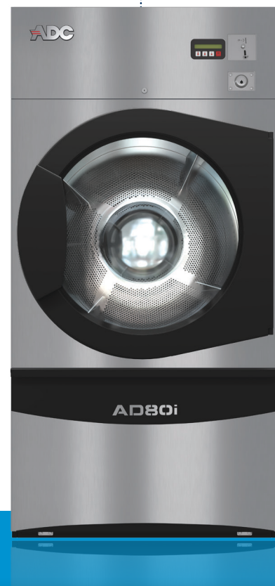
AD-80i COMMERCIAL COIN- OPERATED DRYER