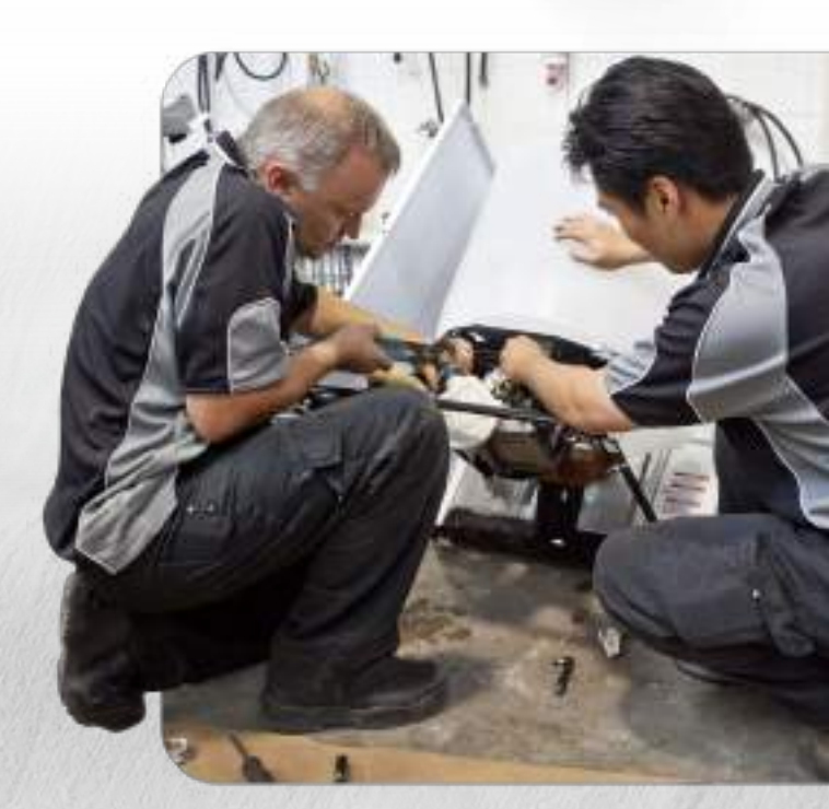
Our promise is in our name.

Email Service@DependableLaundry.com.au Spares@DependableLaundry.com.au